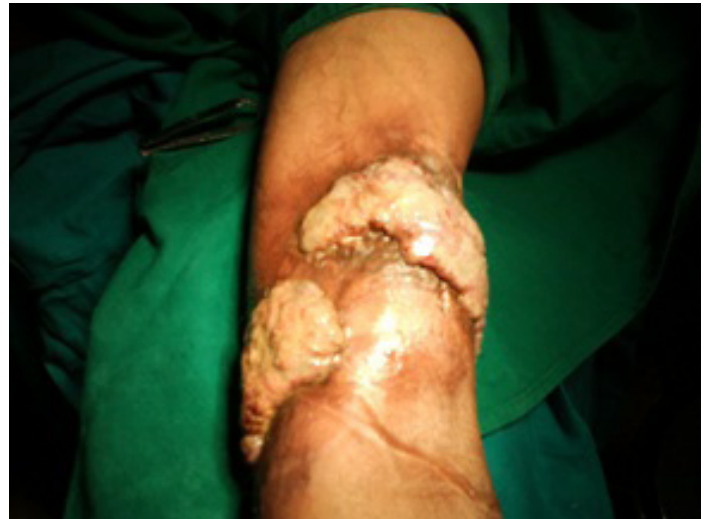
[Table/Fig-1]: Showing Recurrent Phaeohyphomycosis of the forearm